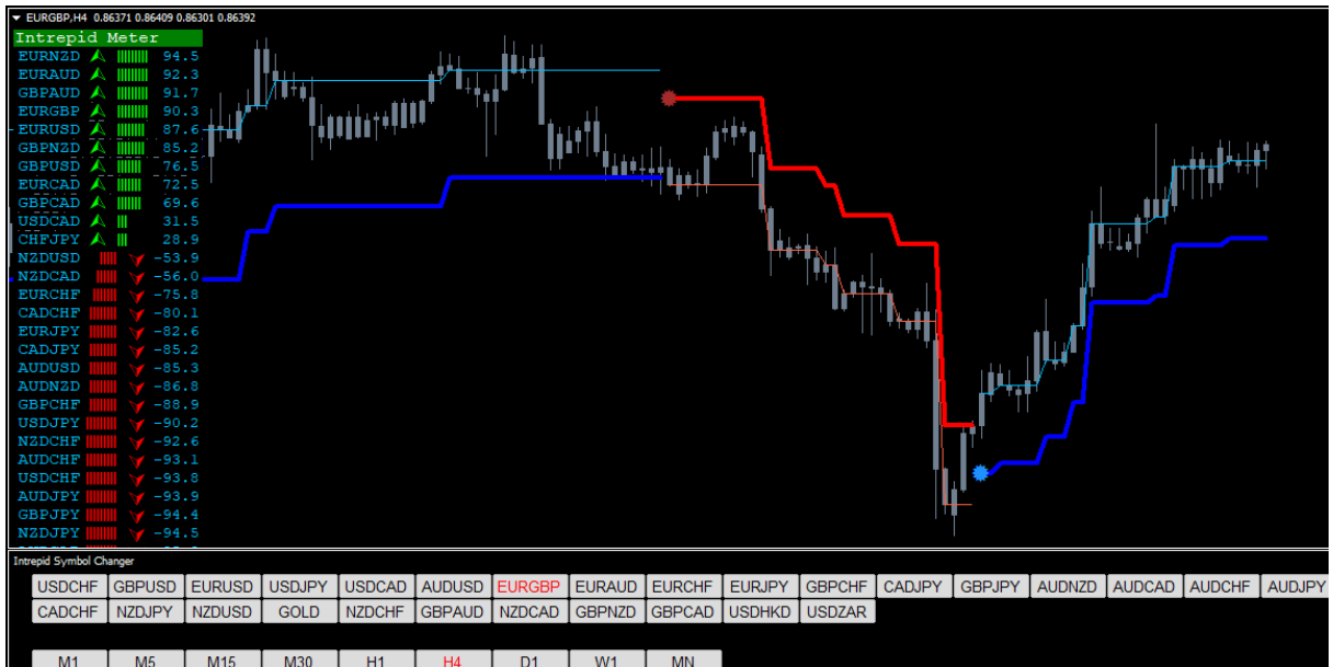
Chart example 7: