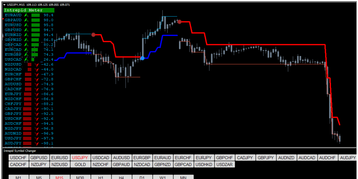
Chart example 5: