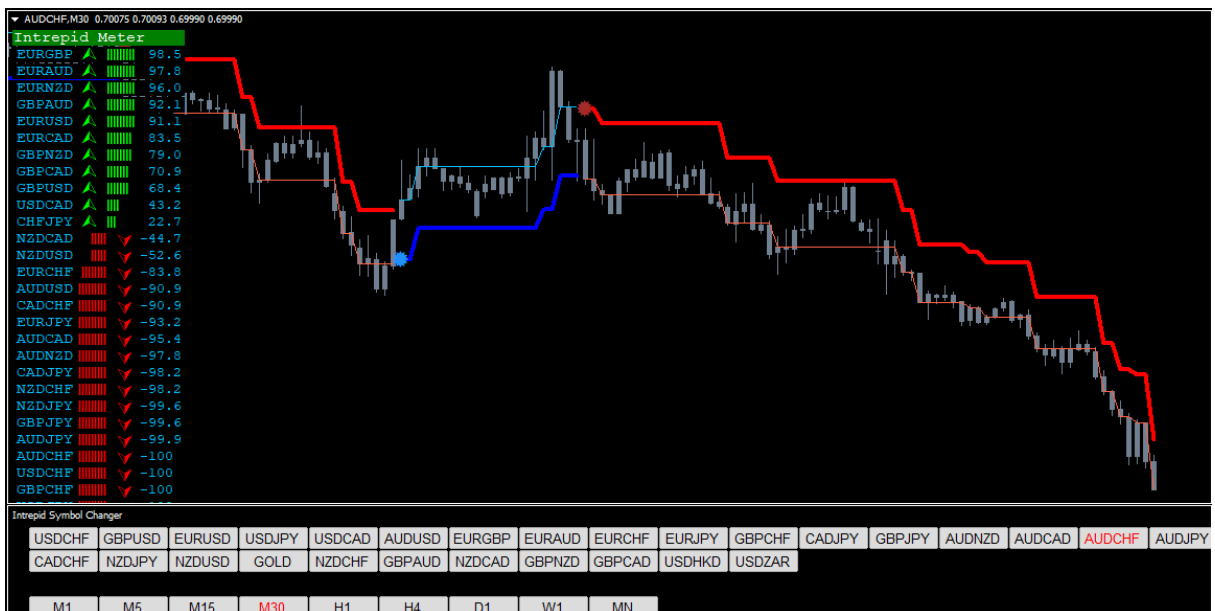
Chart example 4: