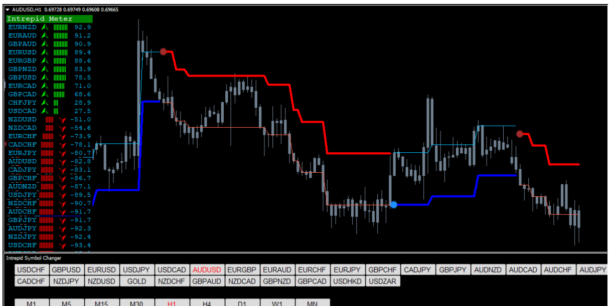
Chart example 6: