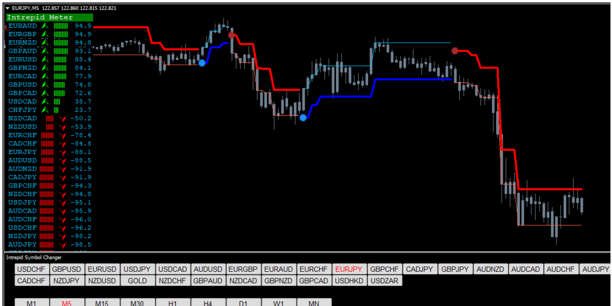
Chart example 3: