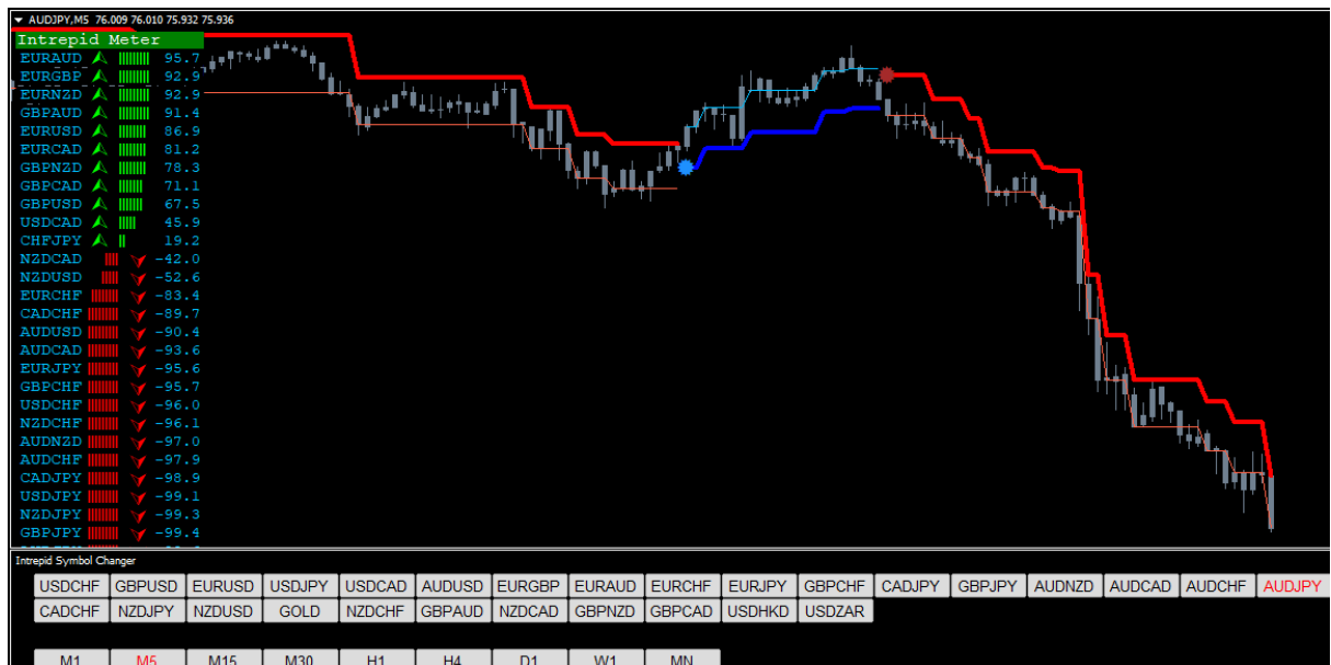
Chart example 2: