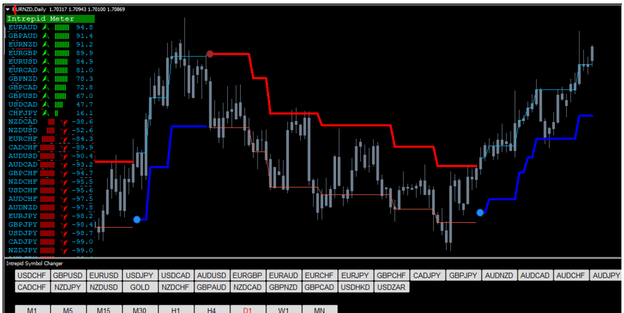
Chart example 8: